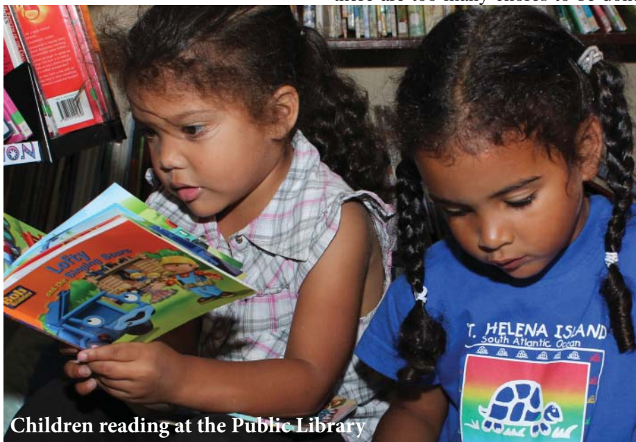
Children reading at the Public Library

Cases will go to the Magistrates' Court on 29th. As a point of interest the Government is employing a full time Chief Magistrate to reside over court in a few months. This new arrangement will mean people spending less time whilst awaiting sentencing.