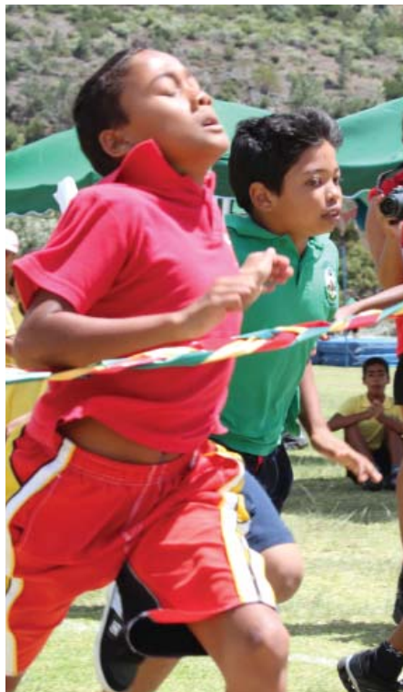
above: crossing the line at Primary School Athletics. report on page 25

quite new to this, have already excelled from a standing start to a first newspaper in just over a month, which I hope you will enjoy reading. It's clear public expectations are mixed, but, hopefully now we are out of the starting blocks the community can now begin to form their own judgements of the value of 'The Sentinel'.