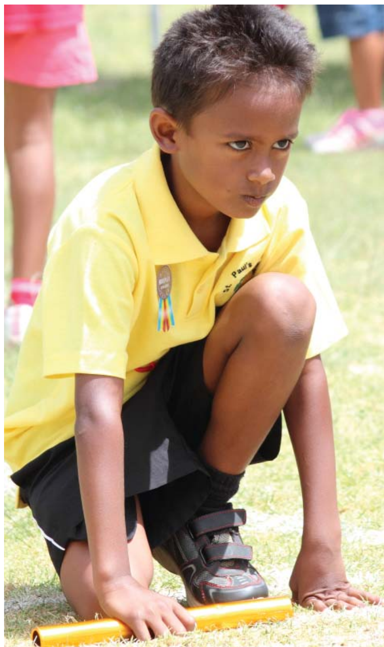
St Paul's Relay runner ready to go at the Primary School Athletics yesterday on Francis Plain. Report on page 25.

Welcome to the very first edition of The Sentinel newspaper from SHBC