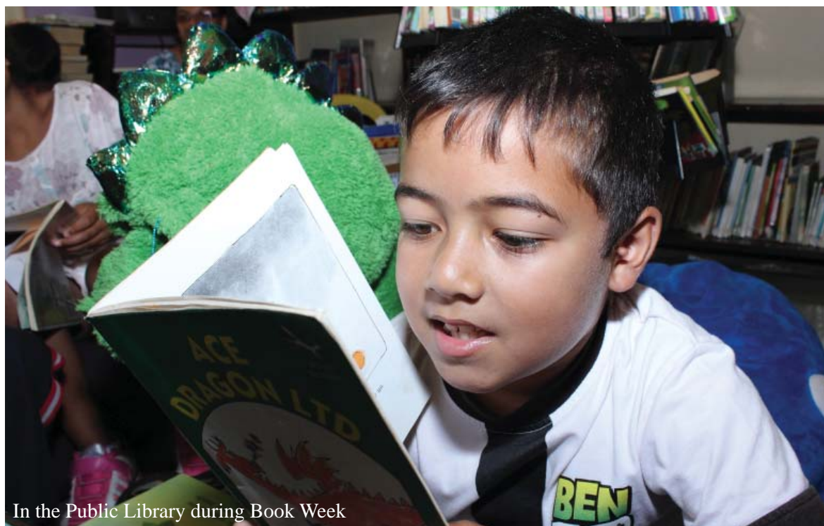
In the Public Library during Book Week

Book week was a well organised event and for one summery week in March 2012, schools and the library made extra effort to emphasise the importance of reading. But when the buzz created by book week dies away will we still be doing all we can to