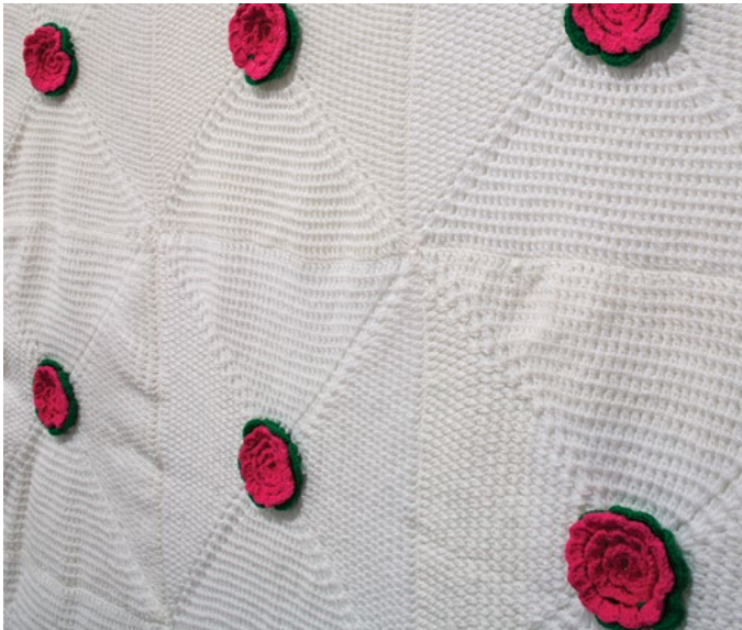
Lavalava kolose (Crocheted petticoats) 2013 Melina Nuese