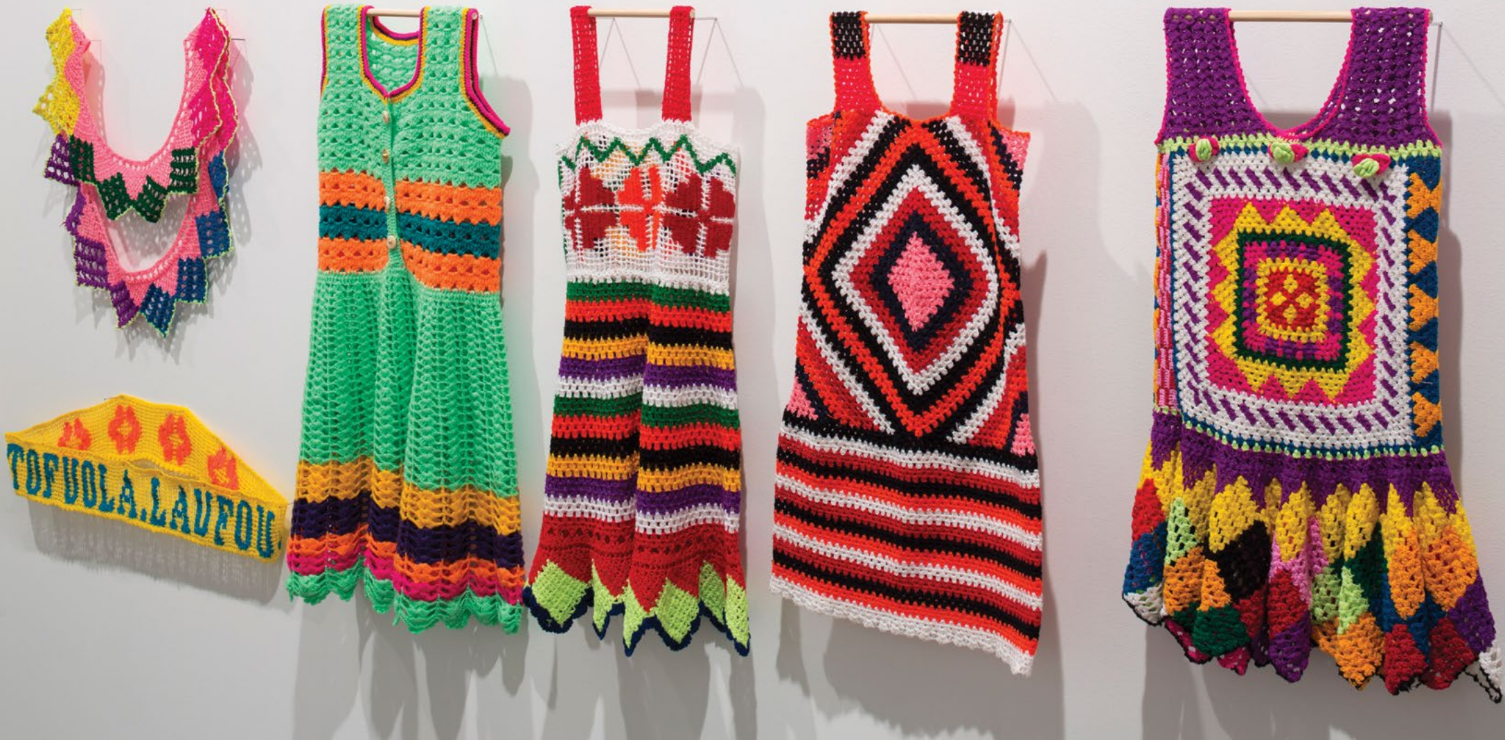
(Top–bottom) Fele (Crocheted borders for petticoats) both made in 2001 by Tapaaki Fakamilo and Lisepa Laufou.