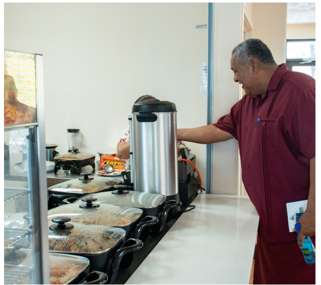
The new Cafeteria will host a few food vendors that will provide meal services to students and ASCC staff members.