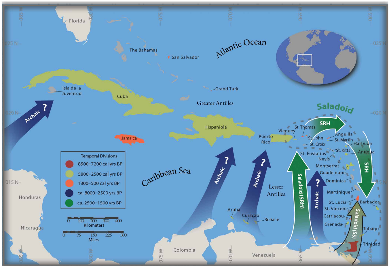
Fig. 1. Bayesian modeled colonization estimates for 26 Caribbean islands suggest two distinct population dispersals. Colonists reached islands in the northern Antilles bypassing islands in the southern Lesser Antilles, refuting a stepping stone pattern. SS denotes the stepping stone model, and SRH denotes the southward route hypothesis.

only 54% of dates meet current reporting standards. Radiocarbon determinations from 55 islands were obtained through an extensive literature review, including available English, Spanish, and French publications, and were bolstered by contacting more than 100 researchers and radiocarbon laboratories to obtain unpublished or underreported determinations and their associated data. These efforts have more than tripled the number of radiocarbon dates used in the last assessment (5). Bayesian analyses of the resulting acceptable 1348 determinations for 26 Caribbean islands provide the first model-based age estimates for initial human arrival in the Caribbean and help resolve long-standing debates about initial settlement of the region.